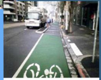
Bike lanes provide safety

By: Township of Woodbridge One Main Street Woodbridge, NJ 07095