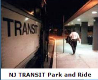
NJ TRANSIT Park and Ride