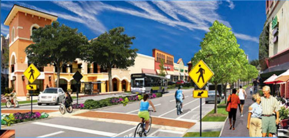
Example of a Complete Street from a rendering in the AARP Bulletin